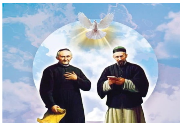
HAPPY FEAST OF ST. ARNOLD JANSSEN AND ST. JOSEPH FREINADEMETZ

04 - 05 March 2023 Divine Word Seminary, Pune